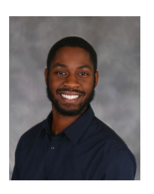
Services Computer Science Graduate. Skills: Windows Server, Active Directory and Office 365 Management, Azure Cloud Service Administration, Azure Private Network Support, AWS Management, Shell Scripting, PowerShell Scripting, Linux/Unix and Windows Administration, VMWare Support, Cisco Router/Switch Administration.